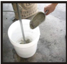
Mixing Of Two Parts