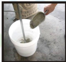
Mixing Of Two Parts